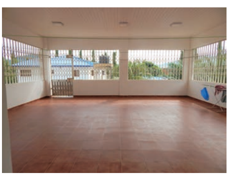
Block D: Garage for three vehicles with one small storage room; electricity control room; three rooms as accommodations for workers; heater room (two heaters for water); large storage room.